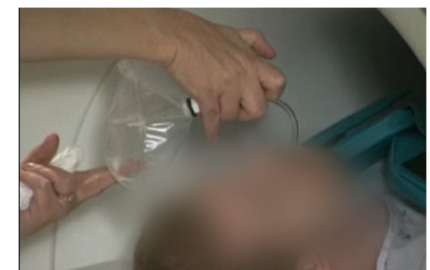
While lying in an MRI scanner, a subject inhales MagniXene™ to map out his lungs' functional microstructure