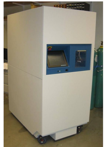
XeBox-E10 delivers cGCP-compliant production of MagniXene™ with on-board diagnosis and quality logging.

Safety; Sustainability: Because no ionizing radiation is used, scans can be repeated or different lung parameters can be assessed in separate breaths. Since the xenon-129 supply is purified from natural air, it is unlimited and affordable.