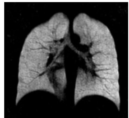
MagniXene™ image of the ventilated airspaces of healthy lungs, depicted as a coronal slice through a 3D dataset

Medical Need: There is a compelling need for improving the care and treatment of patients with respiratory diseases. Chronic obstructive pulmonary disease (COPD) is the third leading cause of death in the United States. While asthma afflicts roughly 8% of the US population, it presents a severe and uncontrollable condition for 1%, roughly three million Americans, leading to frequent hospitalizations throughout their lifetimes. Prevalence of both these diseases is rising, as is their $32B cost of care. By assisting in the approval of new drugs or by guiding interventions, MagniXene™ MRI can likely improve disease management and lower costs. MagniXene™ MRI does not involve ionizing radiation so it can be used repeatedly with minimal risk.